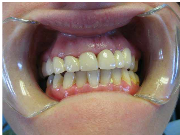
Crowns Correcting Spaces and Misalignment of Teeth