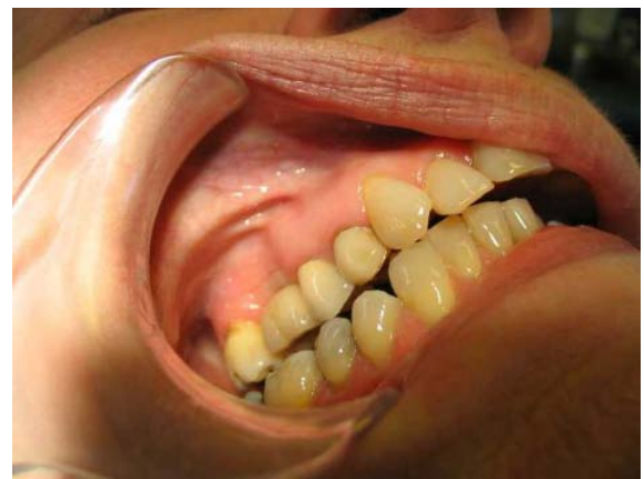
Implant and Crown Replacing Molar