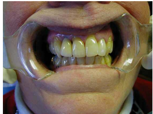
Implant and Crown Replacing Missing Front Tooth