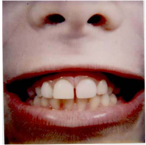
Bonding Repair on Front Tooth